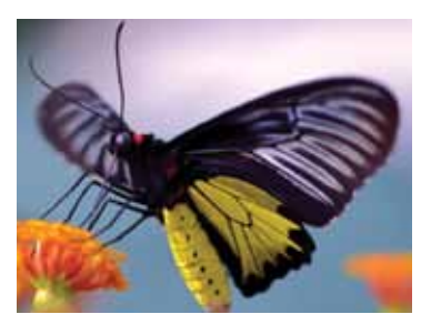
Troides rhadamantus Golden birdwing