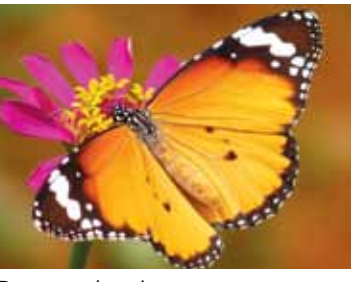
Danaus chrysippus African monarch