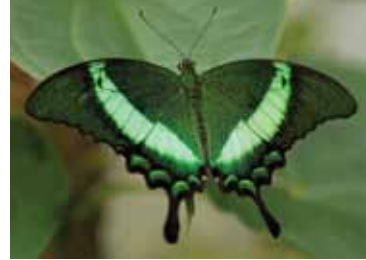
Papilio palinurus Banded peacock