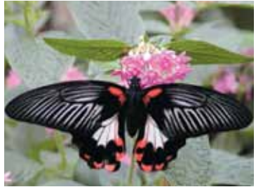
Papilio rumanzovia Rumanzovia swallowtail