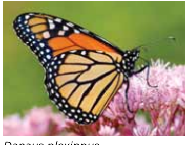
Danaus plexippus Monarch