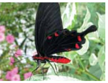
Pachliopta kotzebuea Pink rose