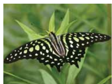
Graphium agamemnon Tailed jay