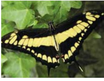
Papilio thoas Thoas swallowtail