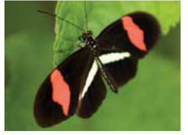
Heliconius melpomene Postman