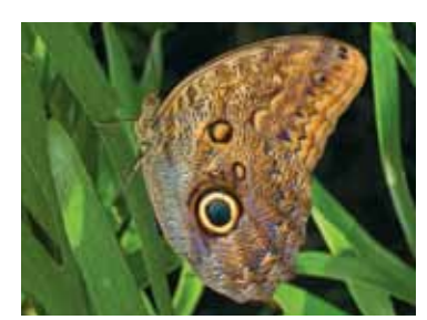
Caligo sp. Owl butterfly