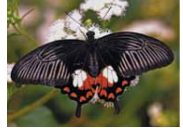
Papilio polytes Common mormon