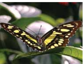
Siproeta stelenes Malachite