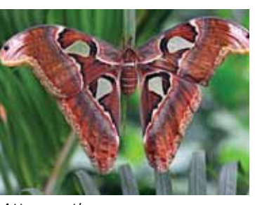
Attacus atlas Cobra moth