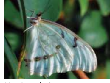
Morpho polyphemus White morpho