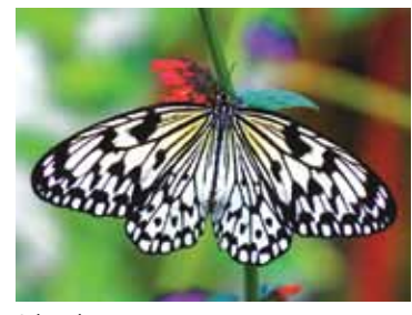
Idea leuconoe Rice paper