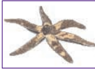
Polar sea star