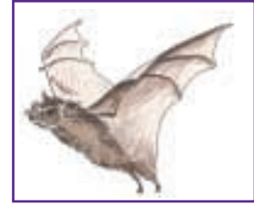
Mexican fruit bat