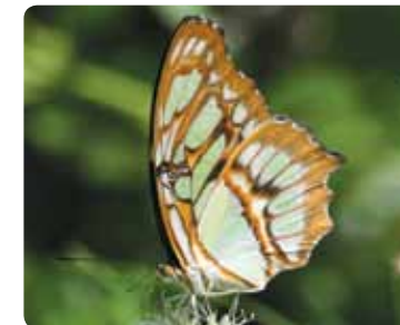
Siproeta stelenes Malachite