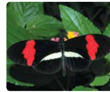
Heliconius melpomene Postman