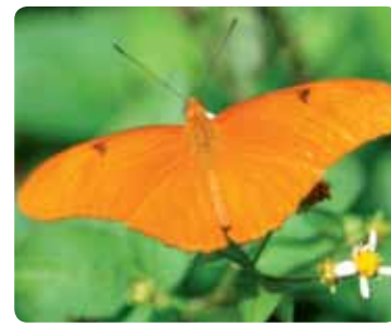
Dryas julia Julia

See if you can spot these butterflies and moths in the greenhouse.