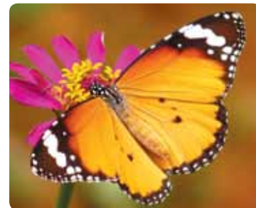
Danaus chrysippus African monarch