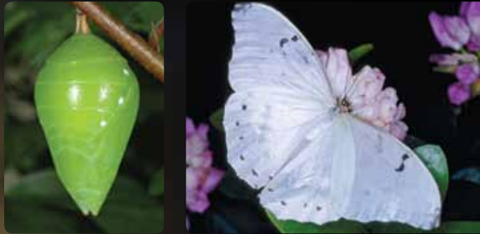
Morpho polyphemus • White morpho