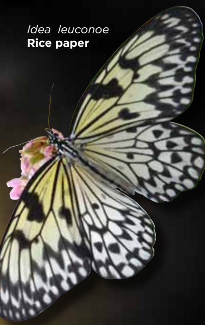
Idea leuconoe Rice paper