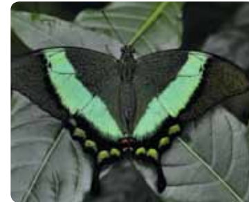
Papilio palinurus Banded peacock