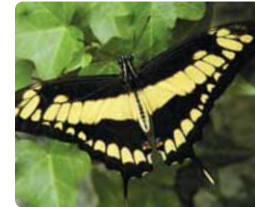
Papilio thoas Thoas swallowtail