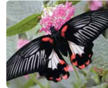
Papilio rumanzovia Rumanzovia swallowtail