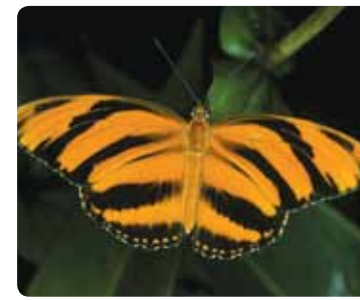
Dryadula phaetusa Banded orange