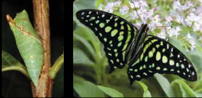
Graphium agamemnon • Tailed jay