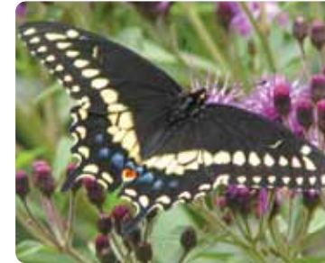
Papilio polyxenes Black swallowtail