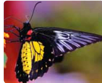
Troides rhadamantus Small troides