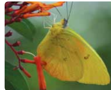
Phoebis philea Orange-barred sulphur