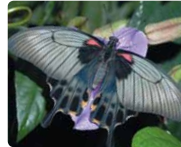
Papilio lowi Asian swallowtail