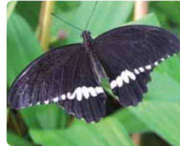
Papilio polytes Common Mormon