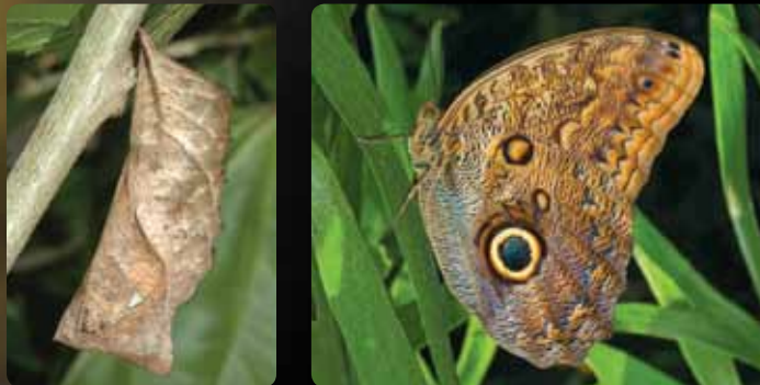
Caligo sp. • Owl butterfly

See if you can spot these butterflies and moths in the greenhouse.