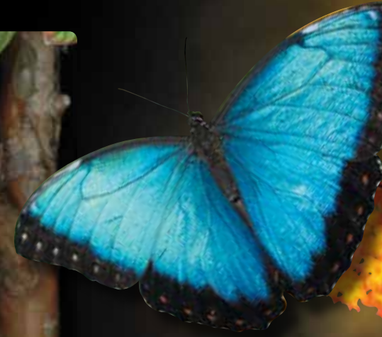
Morpho helenor Blue morpho