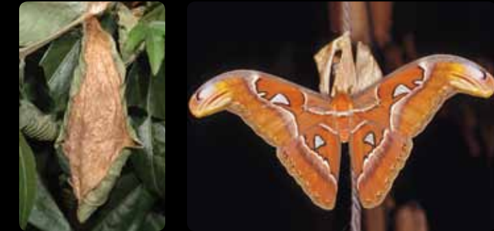
Attacus atlas • Cobra moth

For many moths, once the caterpillar reaches the final stage in its growth, it weaves a silk cocoon for itself. Inside this shelter, it turns into a chrysalis. The cocoon shelters it from the elements and hides it from its predators.