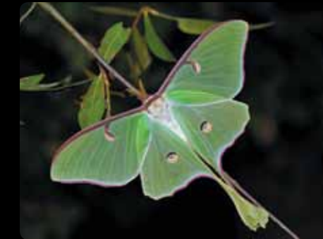
Actias luna Luna moth