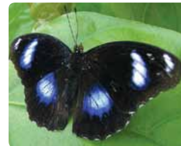
Hypolimnas bolina Great eggfly bolina