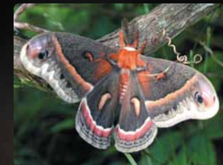
Hyalophora cecropia Cecropia moth