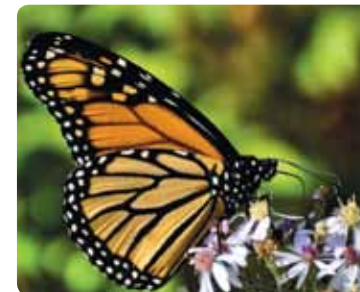
Danaus plexippus Monarch