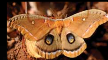
Antheraea polyphemus Polyphemus moth