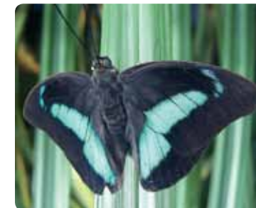
Archaeoprepona demophon One-spotted prepona