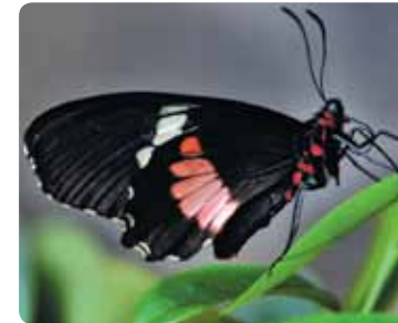
Parides iphidamas Transandean cattleheart