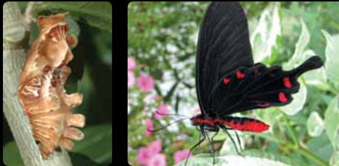
Pachliopta kotzebuea • Pink rose