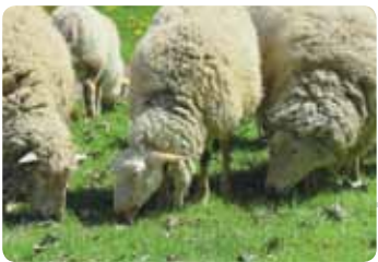
Sheep at the Garden

Youth Gardens Programs for young Montrealers