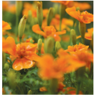
Marigold Tagetes sp.