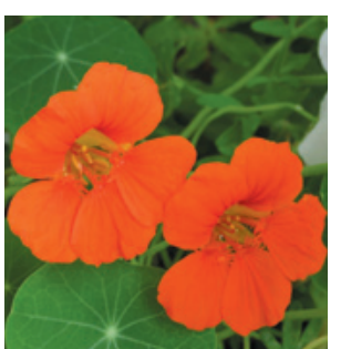
Garden nasturtium Tropaeolum majus