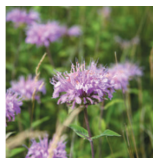
Wild bergamot Monarda fistulosa