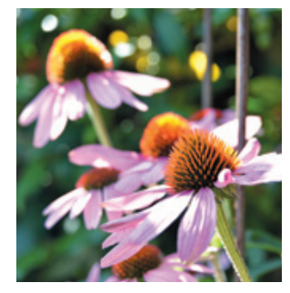
Coneflower Echinacea sp.