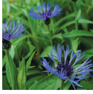
Cornflower Centaurea cyanus