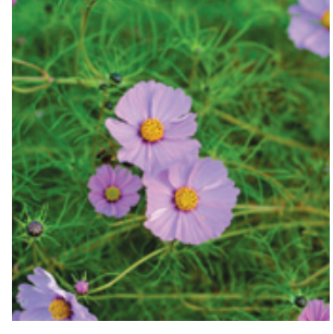
Common cosmos Cosmos bipinnatus