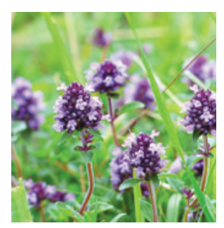
Culinary herbs* Some are perennials.