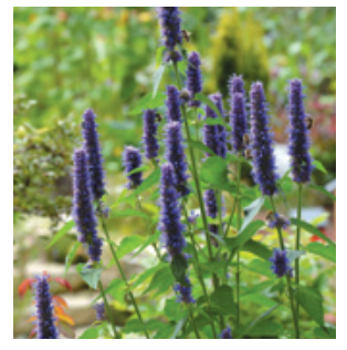
Blue giant hyssop Agastache foeniculum