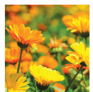
Pot marigold Calendula officinalis