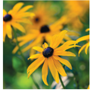
Black-eyed Susan Rudbeckie sp.